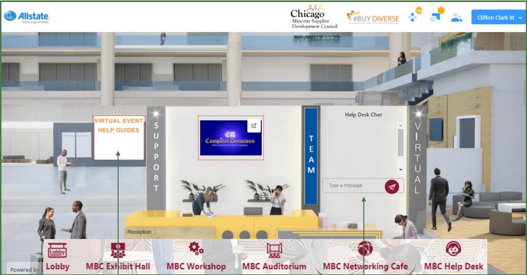
Download event FAQ's